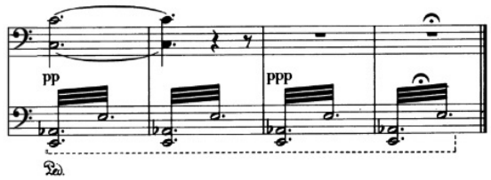
Example 18 – La lugubre gondola, finale, mm. 117–120

The interpretation of mm. 77–94 as a development which brings us back from A minor to the D \flat is supported by what happens in the last 26 measures. First, at m. 95 the left hand begins a tremolo with an A \flat , hardly explicable as the leading note of A minor. Secondly, the right hand repeats in octave the mm. 3–18 of the beginning, but instead of ending on the tonic, this time Liszt preserves the tonal ambiguity, and the piece ends on the augmented triad C-E-A \flat , which is deprived, in the last three measures, of the tonic, in this way increasing the ambiguity (Example 18).