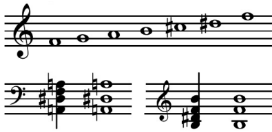
Example 8 – Unstern! Climax I, derivation from the whole tone scale mm. 45–46

The progression leads to the first climax of the work – as there is a development section which consists of two subsections, there are two climatic moments – at m. 45. The extreme dissonant chord is a result of the superimposition of the A-D#-F-A and B-D#-F-B chords, in which what is relevant is neither the second interval A-B, nor the diminished third D#-E, but the fact that these chords are the super-