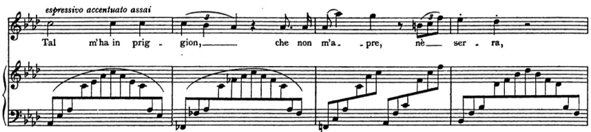
Example 2 – Petrarch Sonnet S. 270/1, mm. 45–48