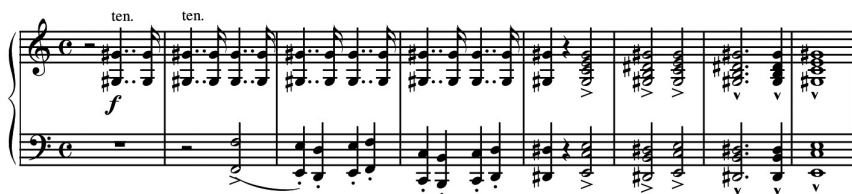
Example 5 – Unstern!, development I, mm. 21–28

then repeated once again starting from E, and then restated twice starting from A, videlicet a fourth higher. The first variation (Example 5), which opens section B, begins at m. 21 with a dotted rhythm ♩. ♩ which is nothing else but a contraction of the original ♩. ♩ (m. 3). Further evidence that everything in this work is a direct result of calculation is given by the left hand, which begins at m. 22 (with a rest) in what seems to be a new melodic figure. Closer analysis reveals that it is actually a «rhythmisch [...] „ausgefüllte“, nivellierte Variante des Einleitungsmodells, mit dem es den „Umriß“ teilt» 29 .