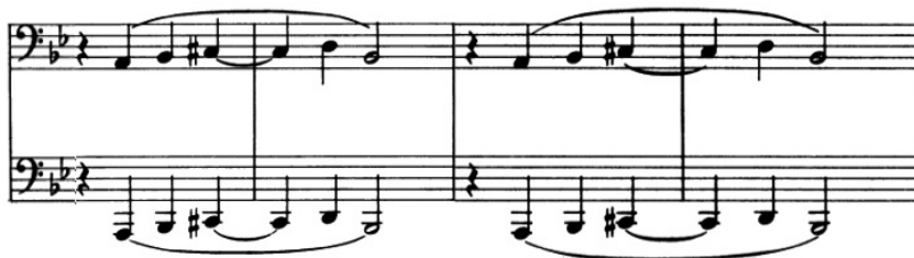
Example 15 – Nuages gris, B section, mm. 21–24

What is most interesting in this work is its form, which is a simple A-B-A'. The sections A and A' have already been analysed. The B section – which works as a sort of development, because of its morphological and syntactical affinity with the A section – is reduced to four measures. It is possible that in this work Liszt is dealing with simplifications: the evergreen relationship V-I is simplified and it is consequently reduced to its basic elements, and the B section – usually a relevant part in the A-B-A' form because of its contrasting character – is reduced to a simple (and ambiguous) modulation. The simplification of this section is easy to explain: there is no need for a section which moves away from the tonic, since there is no tonic, and there is no longer a reason to build a tonally unstable or contrasting section. Outside the tonal system there are no necessities, except for those of the composer.