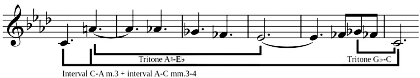
Example 16 – La lugubre gondola, mm. 6–11

At m. 19 the tonic upon which the treble plays a chromatic scale appears, which erases the tonic atmosphere. A bridge (mm. 30–37) leads to the leading note of B minor. A fermata creates a clear division between section A and its repetition in a new tonality ( A' ). The interesting features of this work are all in the last