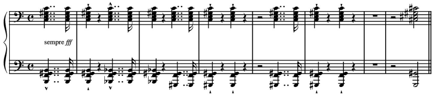
Example 10 – Unstern!, climax and disassembling process, mm. 77–84

rising all the previous elements, then from there he returns to the silence. The extremely dissonant climax is disassembled by Liszt moving just one voice at a time and at just a half step, and through the removal of the dissonant material (Example 10). First the left hand removes the tritone descending from B to B \flat (m. 78); consequently just the augmented triad harmony remains (m. 79–82), with an added F, which is then enharmonically intended as an E \sharp , and used as the link between this dissonant augmented harmony and the perfectly tonal C \sharp chord (V of the V) of m. 84, of the quasi organo chorale in B major.