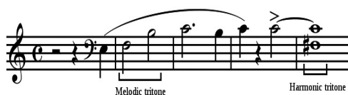
Example 4 – Unstern!, Melodic and Harmonic tritones, mm. 1–5

The work begins with a rest, during which the tension is (in the first measure at least graphically) accumulated, and from which a mf pesante , the motive which constitute the harmonic material, arises (Example 4): a melodic tritone in m. 2, and a harmonic tritone in m. 5. The first five measures are