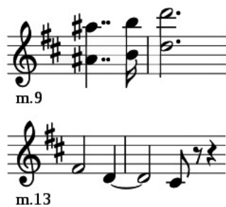
Example 10 – B minor Piano Sonata, relation between motivic cell 2 and 3

The Sonata arises from silence, from which two repeated Gs appear – which, according to the Liszt pädagogium are to be played as Paukenschläge 73 – followed by a descending phrygian scale. This three measure figure is immediately repeated, but this time the descending scale follows the model of the Hungarian one ( Example 7 ) 74 . The tonal ambiguity is the first element that is recognised by our ears: a sonata whose tonality is B minor opens with a polarization of G. Liszt is creating an introduction/exposition based on the sixth grade of the B minor scale. After these scales, we hear another two Gs, which suddenly explode with an octave jump into an Allegro energico with f indication ( Example 8 ), which contrasts with the p sottovoce of the beginning, and with which the