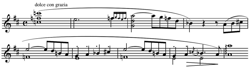
Example 16 – B minor Piano Sonata, second motivic cell variation, mm. 125–133

m. 109 it reveals its true nature with the second interval – which is, as already pointed out, the interval upon which the beginning is built, and that in this case must be understood as a seventh – followed by the descending scale. The Crux fidelis motive occurs just four times in the whole Sonata 81 , and it is always sustained by the first motivic cell (except in mm. 700–703); namely, following the eschatological interpretation, the theme of Good is strictly related to that of Evil – and that could be a sign of the eternal battle between the two forces, but it could even be seen as the idea of contrast in general, since one can think about the two contrasting forces as a representation of the first and the second theme of classical sonata form, or as the concept of progress and tradition, or as any other pair of opposites –, but the Evil themes are never contrasted, or sustained by the Good motive. It is not the aim of this dissertation to present a last word about the programmatic interpretations of the Sonata , but it is believed that, since Liszt did not attach any programme to the work, it would be better to analyse this work without any reference to any hypothetical programme.