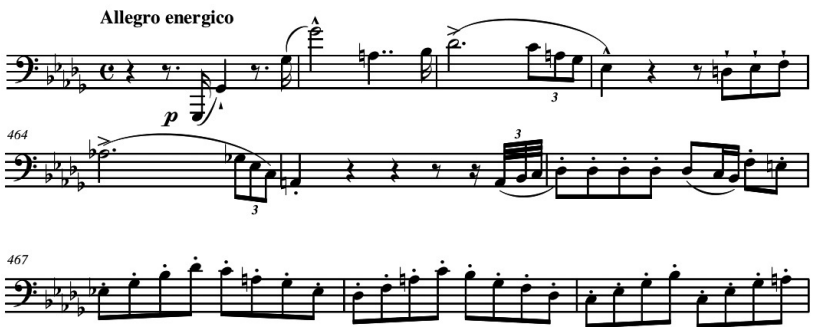
Example 6 – B minor Piano Sonata, mm. 460–469

This is the beginning of a slow section which contrasts with the climate and the agitated rhythm of the first movement, but it is nevertheless based on the three motivic cells exposed in the first seventeen bars of the Sonata . In this section they are transformed, varied, and exposed in a more intimate way that creates a sense of suspension. Just like the first one, the second movement is cyclical too. The climate of the end recalls the beginning of the section (till m. 459). Furthermore, it ends in the same key, F#, which is the dominant of B minor. Here it again recalls the sound of the first motivic cell with its descending scales, this time build upon the dominant of B. The first motivic cell exposed at his dominant gives the idea of a recapitulation. But Liszt, who is working “against” the fixed formulas interpreted enharmonically the F# as Gb, and instead of the recapitulation he gives rise to the third movement Allegro energico in Bb minor ( Example 6 ).