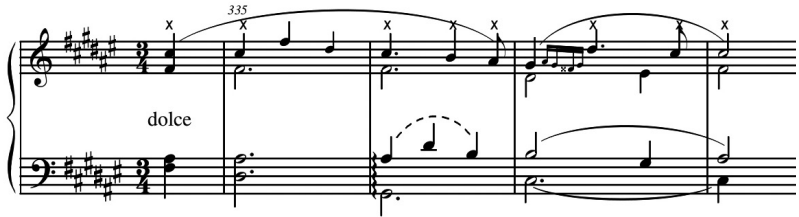
Example 5 – B minor Piano Sonata, mm. 335–338

The second movement begins at m. 331 with the Andante sostenuto which exposes a new thematic idea in the first four measures, and then (m. 334) it turns into a transformation of the third motivic cell, with the motive hidden in the treble voice of the melodic line ( Example 5 ; the motive is marked with an “X”).