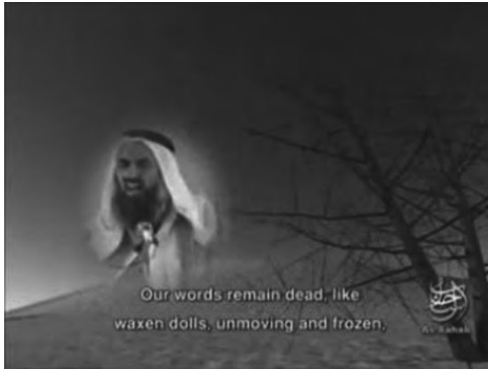
Fig. 1: Screen shot of the video Winds of Paradise (I)

provided for and safeguarded by the sacrifices of martyrs, describing their blood as the water that irrigates the tree of Islam, 49 the “water of life for this religion.” 50 The first video in the series Winds of Paradise features, as way of introduction, a computer animation visualising this statement: a video recording of one of ‘Azzām’s lectures is inserted into the animation of arid land with desiccated trees. The recording features the statement already mentioned at the beginning of our considerations: “Our words remain dead, like waxen dolls, unmoving and frozen, until when we die for them, they rise up, alive, to live among the living” (see fig. 1). Simultaneously the trees in the background once again flourish and the earth becomes green as the names of the seven martyrs to be presented appear in golden letters in the sky. 51