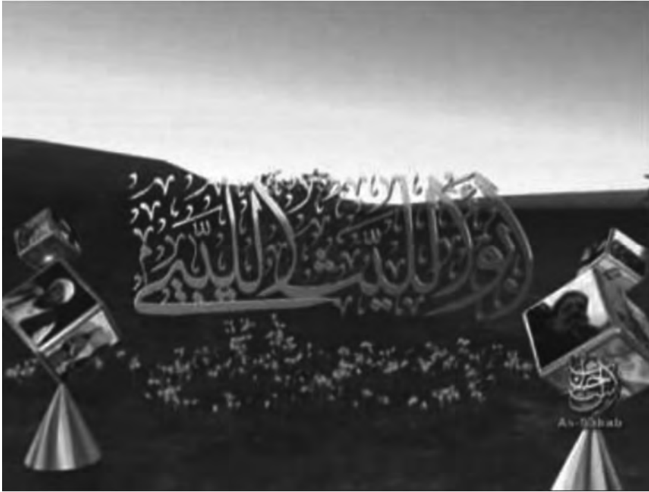
Fig 2: Screen shot of the video Winds of Paradise (III) the golden letters give the name Abū Laith al-Libī, the four cubic structures display video recordings of al-Libī.

four cubic structures displaying videos of al-Libī (see fig. 2). This is an especially striking example for the all-out martyr cult of al-Qaida despite its severe reservations against hagiolatry stemming from their Wahhābī/Salafī doctrine. 52 Whereas real Šūfī shrines are something to be detested, virtual shrines which visualise the elevated status in the Hereafter may be erected.