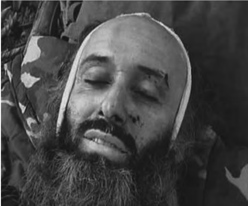
Fig. 3: screen shot showing Abū Sa‘īd al-Qurtashā‘ī

zooms out and it becomes apparent that all his limbs are severely injured and he has lost an enormous amount of blood. The last 90 seconds concentrate mainly on his face. The cameraman obviously catches his very last breath and afterwards he lies calmly on the ground, a peaceful smile on his face. While the pain of dying is not hidden, it comes across as soothed without the original sound and with the consoling text of the nashīd . The peaceful last breath (or what is presented as such) recalls a Hadith, where death for a martyr is compared to the pinch of a gnat (see fig. 3).