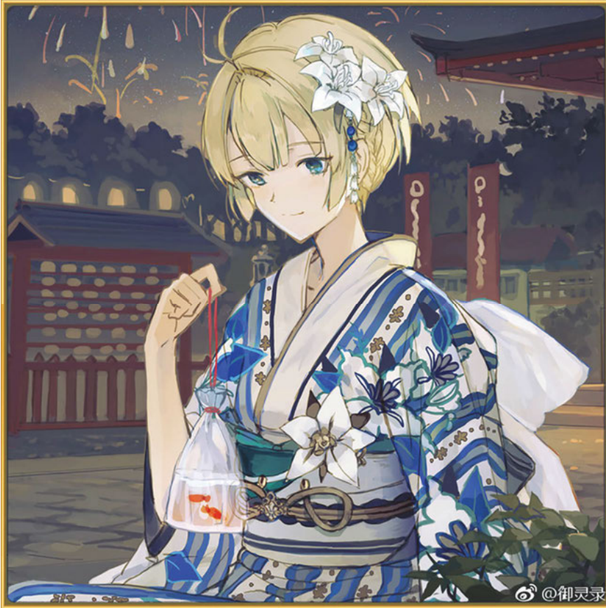
Image 4: Hihara You, Joan of Arc Fireworks , female hero in the Japanese video game Otogi: Secret Spirit Agents , illustration.

symbols of feminine charms and virtues, 46 is associated here with the iconography of an ambivalent woman, a heroine whose deeds ran contrary to the traditional gender conception of femininity. A similar metamorphosis was typical of other famous heroines of European history, for example, Joan of Arc, often portrayed in the nineteenth century with light or golden hair (Image 4). 47