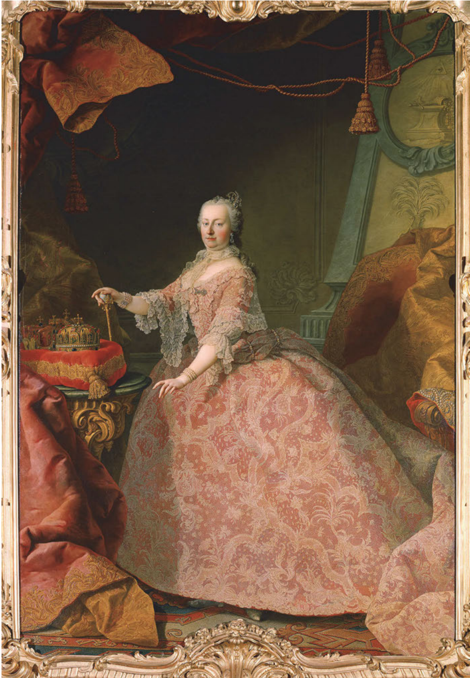
Image 2: Martin van Meytens, Maria Theresia (1717–1780) im rosafarbenen Spitzenkleid , oil on canvas, c. 1750/55, Vienna, Kunsthistorisches Museum, inventory number GG 8762.