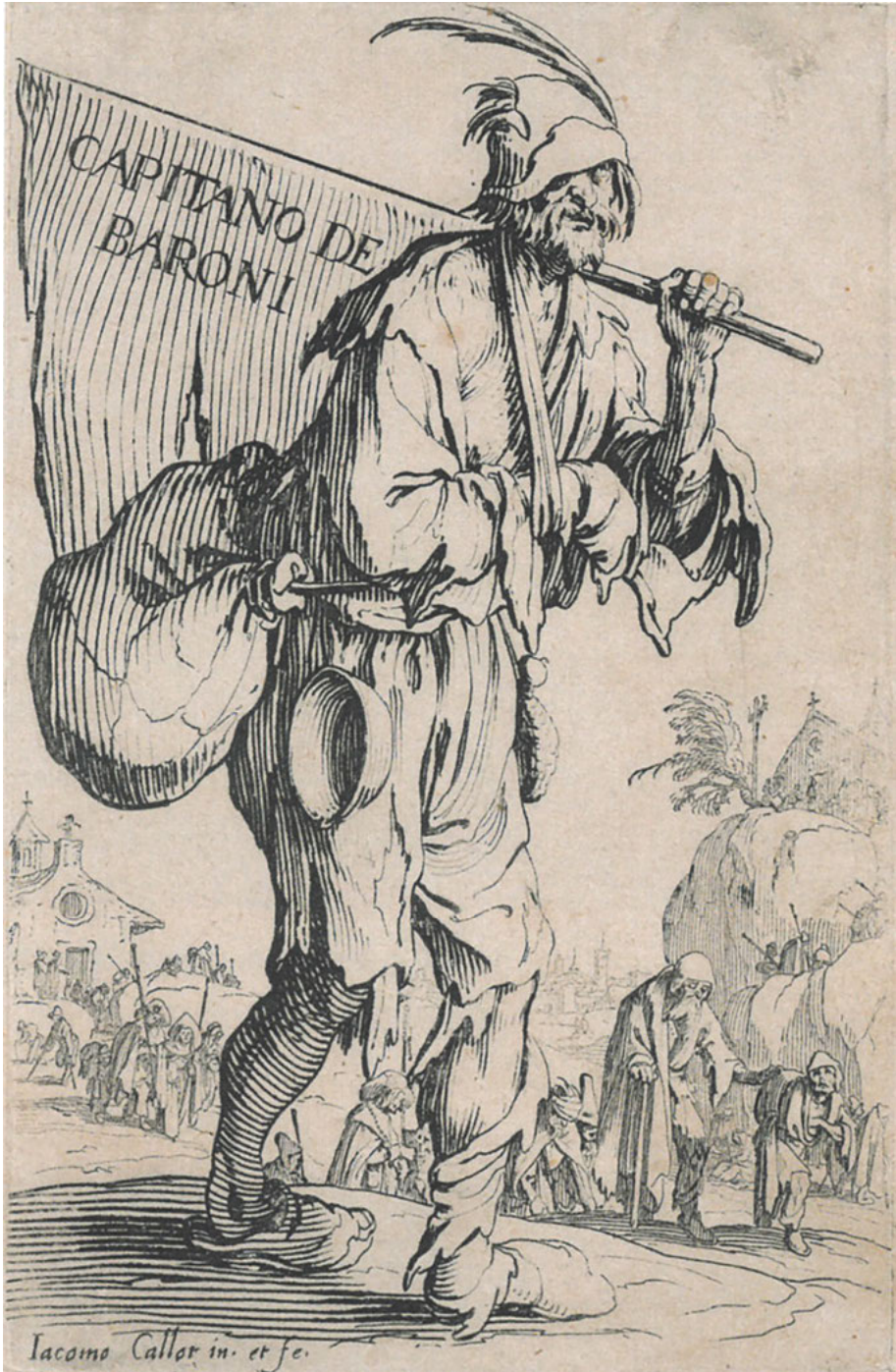
Image 4: Jacques Callot, Frontispiece of The Paupers , British Museum (inv. X,4.211), 1622–23, © Trustees of the British Museum.