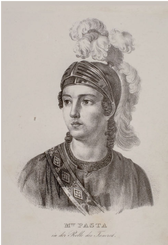
M me PASTA in der Rolle des Tancred.