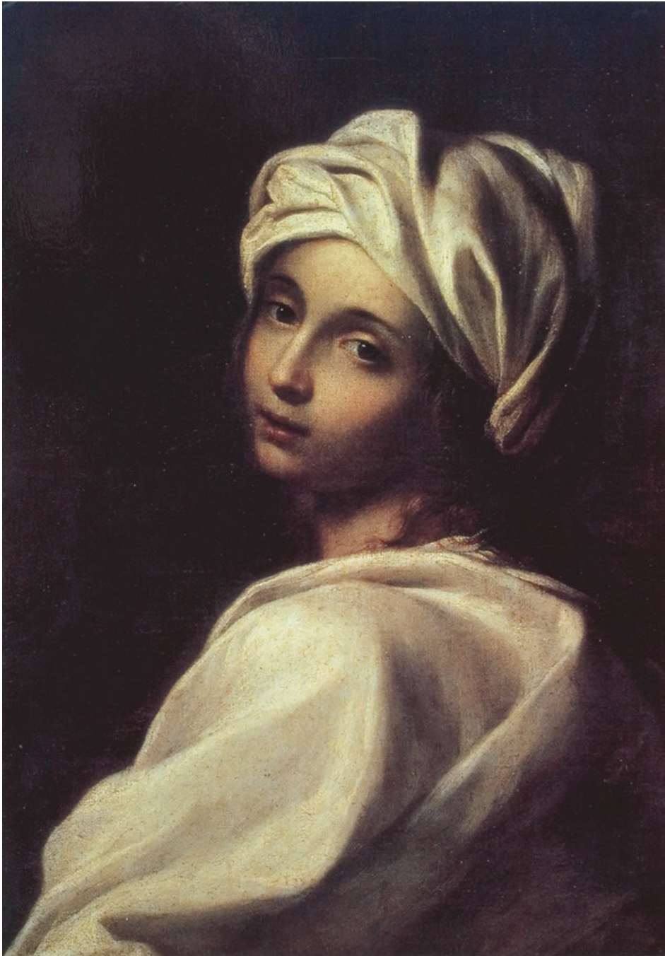
Image 3: Guido Reni attr., Ritratto di Beatrice Cenci , oil on canvas, 64.5 × 49cm, Rome, Galleria Nazionale D'Arte Antica, Palazzo Barberini, inventory number: 1944.