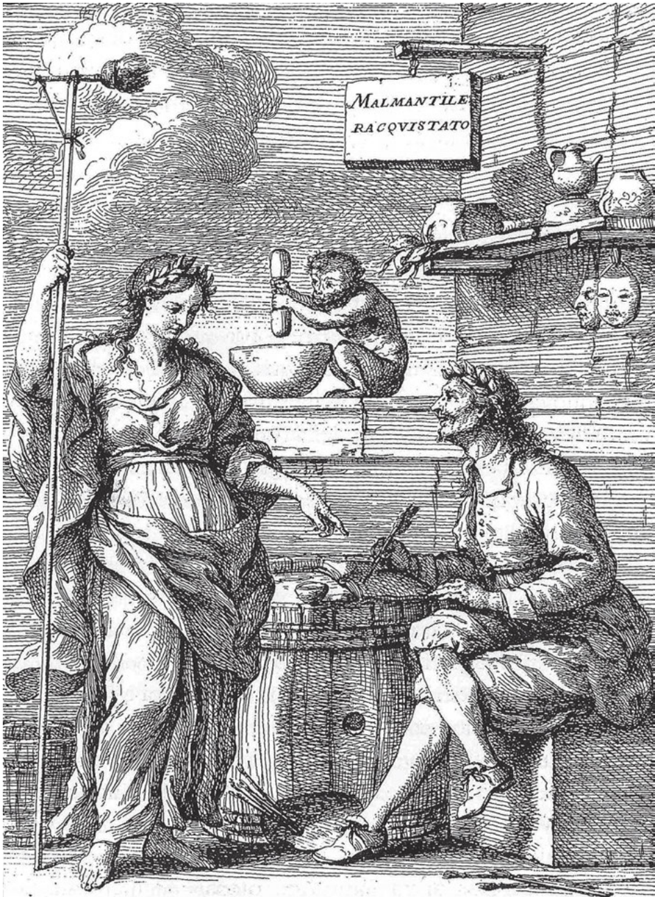
Image 2: Frontispiece of Lorenzo Lippi's (known as Perlone Zipoli) Il Malmantile Racquistato , 1750, Florence.