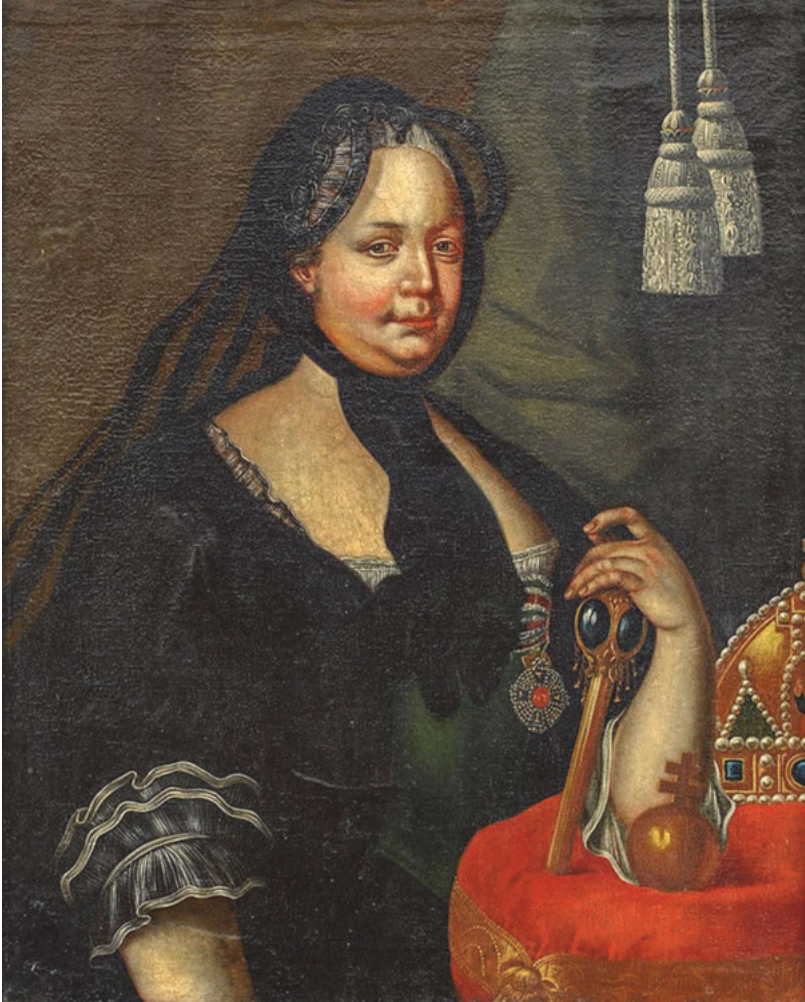
Image 3: Anonymous imitator of Joseph Ducreux, Kaiserin Maria Theresia als Witwe , after 1769, oil painting.

if that was one of Francis Stephen's biggest wishes, causing many disputes among the couple. 46