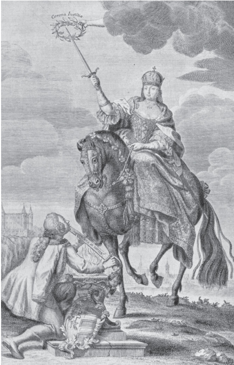
Image 1: Franz Leopold Schmittner, Maria Theresia, römisch-deutsche Kaiserin , engraving, 1741, Paris, Hachette Livre.