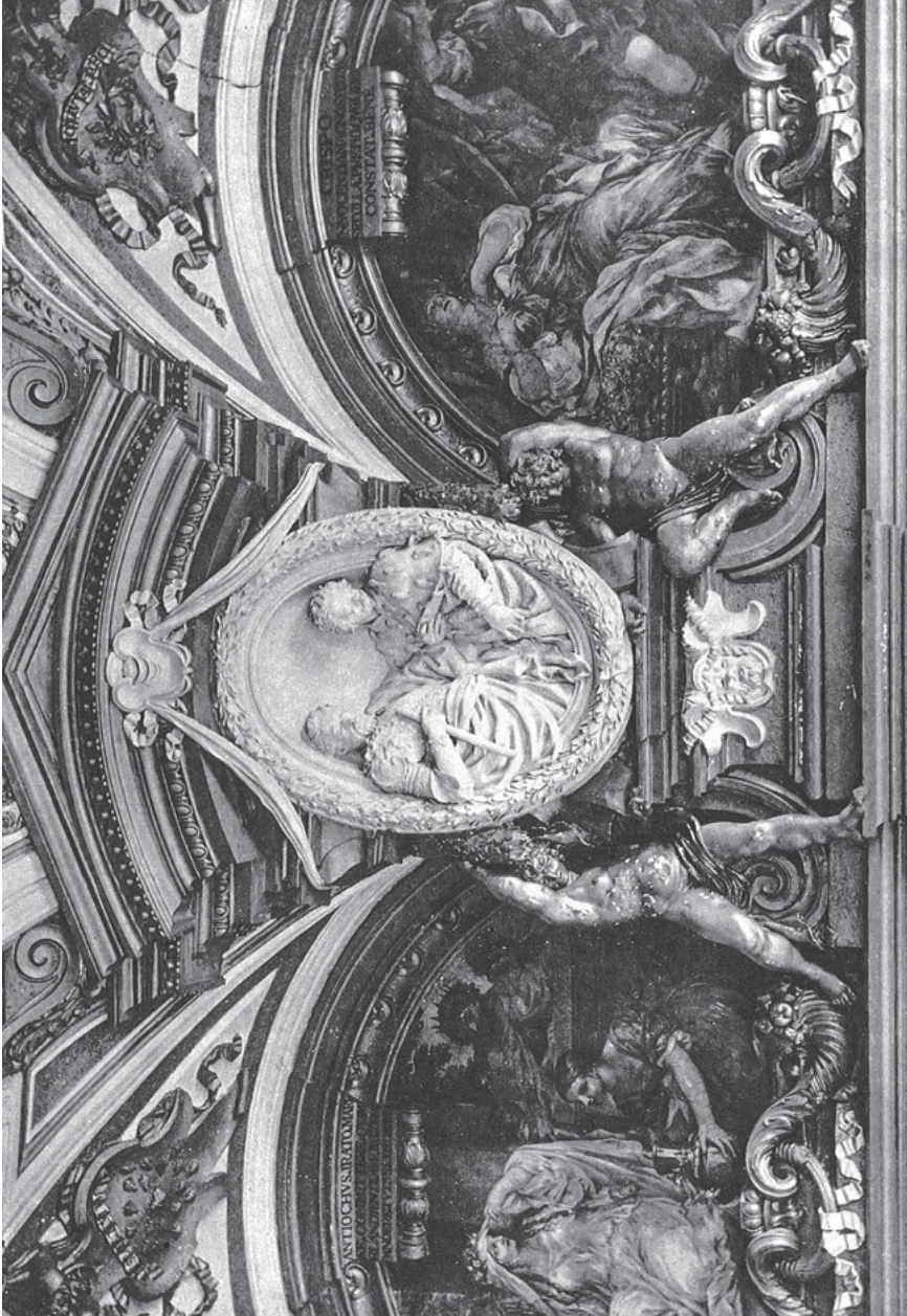
Image 1: Pietro da Cortona, Stucco portraits of Ferdinand I and Cosimo II, 1642, Sala di Venere, Palazzo Pitti.