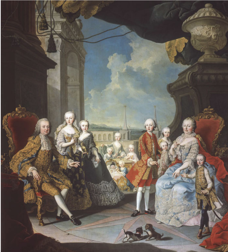
Image 4: Martin van Meytens d. J., Kaiserin Maria Theresia mit ihrer Familie auf der Schloßterrasse von Schönbrunn , oil on canvas, 1754, Vienna, Schönbrunn Palace, inventory number GG.007458.

according to the common view at the time – peace, independence, and welfare. 59 In this context, it is easy to understand why Maria Theresa's enormous fertility was considered very positive by contemporaries. 60