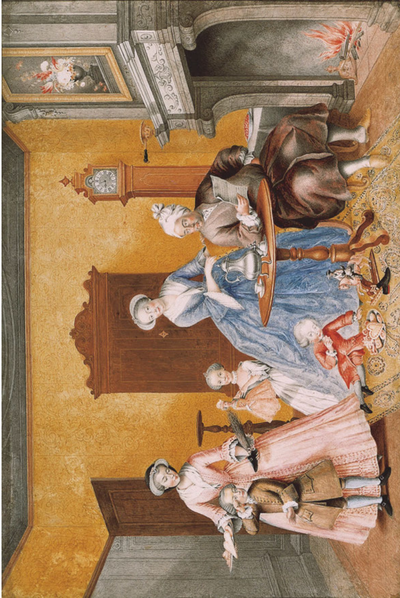
Image 5: Unbekannter Künstler, Erzherzogin Isabella von Parma, Nikolobescherung in der kaiserlichen Familie , Gouache on paper, 1762, Vienna, Schönbrunn Palace, inventory number GG.007521.