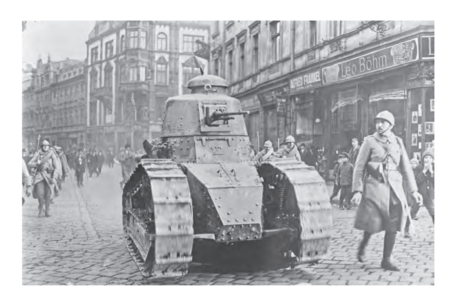
French patrol in Katowice/Kattowitz during the plebiscite of 20 March 1921.

However, calling on Upper Silesians to decide on remaining with Germany or joining Poland did not defuse local tensions. As a matter of fact, both before and after the plebiscite of 20 March 1921, Polish insurgents clashed with German paramilitary forces in order to influence the outcome. Putting the region under international administration for at least a year before holding the plebiscite was supposed to prevent this eventuality, and provide local populations with a 'cooling off period'. In practice, the Inter-Allied Commission did little to calm nationalist mobilization. Quite to the contrary: while the French, whose contingent was by far the biggest, more or less openly backed the Polish insurgents, the British and Italian detachments tolerated the armed activities of right-wing German Freikorps . The results of the plebiscite showed another limitation of the plan