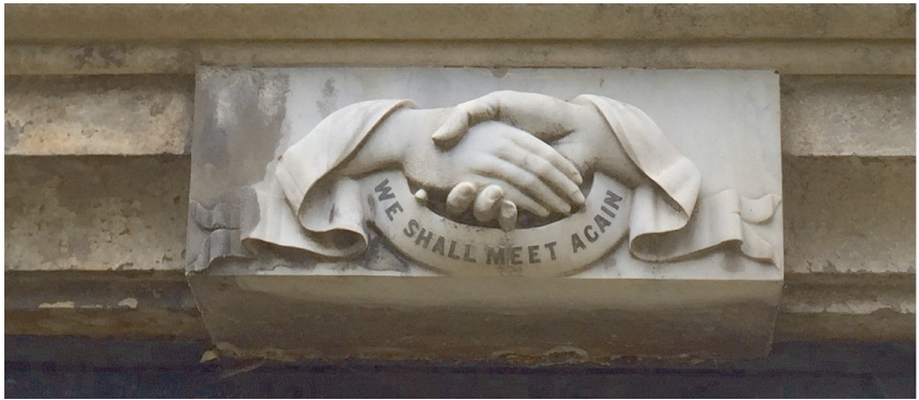
Fig. 3: Symbolic and decorative elements (Image: Carla Danani 2017).

This text has some subtexts: this means that one has to recognize many authors and many readers. There are elements that allow the discovery of their enunciator (author) and listener/reader (receiver). 29 On the one hand, the communicative pact between them depends on the specific kind of text a cemetery is, for it is a place but it is not a hospital or a school. On the other, the pact depends on the specific ways in which the exchanges can happen. They can be, for example, more or less intense from an emotional point of view. In the case of cemeteries, the fact of lasting in time complicates and multiplies these relationships, but many signals give instructions on how to manage the text. It is important to pay attention to different architectural typologies, to titles and epigraphs, to symbolic and decorative elements (fig. 3). 30 In Highgate there are artefacts with effects designed to convey representational meanings - for example a tomb with a curled-up dog (fig. 4), graves with angels (fig. 5) - and others with a marked constructive function, 31 for example stairs and narrow passages (fig. 6). Some of these are «mythical buildings». By this, I mean buildings that allow the viewer to go beyond their function and to understand more than what is explicit.