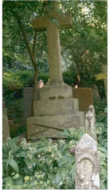
Fig. 2: Short-rotation vegetation (Image: Carla Danani 2017).

Like every landscape, Highgate can be experienced in different ways: a haptic perception 21 is different from an optic look, for example. We call optic a kind of look arising from an external point of view, but able to catch the overall frame of a place. We call haptic a kind of complex perception in which sensory, motion and cognitive systems all work together; it focuses on things giving the observer tactile, immersive effects. 22 Haptic percep-