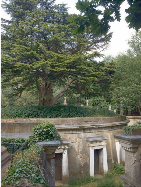
Fig. 1: Long-rotation evergreen, Cedar of Lebanon.