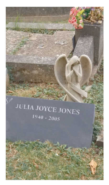
Fig. 8: A small white marble angel stands behind a black marble memorial plaque. Highgate East Cemetery.

tual circumstances, the actual context.<sup>40</sup> If we have a closer look at an angel figure on a more recent grave in the Eastern part of the cemetery we will understand how Kierkegaard's thesis of repeating can also function on an aesthetic level: by adapting a specific iconography to a new context (fig. 8) the artist transfers the past – as a repetition of a specific visual strategy in combination with individual and collective commemoration processes – into the present and in this sense (makes eternity visible).