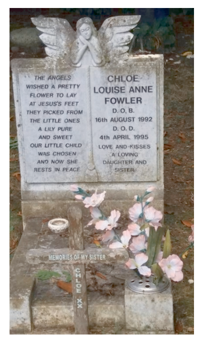
Fig. 1: The melancholic angel: The tomb of Chloe Louise Anne Fowler, a three year old girl, in the Eastern part of Highgate Cemetery, London (Image: Natalie Fritz 2016).

«The Angels wished a pretty flower to lay at Jesus's feet/they picked from the little ones a lily pure and sweet/our little child was chosen, and now she rests in peace.» This bittersweet poem is engraved on a tombstone erected on a grave for a three year old girl (fig. 1).