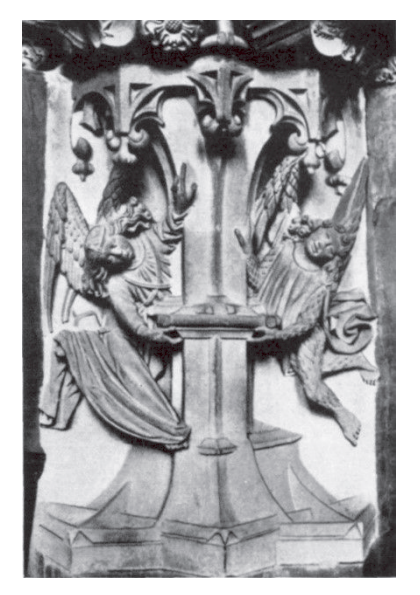
Fig. 5: Gernsbach (Baden), last third of 15th century: Angel at the house of sacraments; the angels are feathered.

cipatory potential, and generate the utopian hope of recovering the unities lost in the process of rationalist fragmentation and reconstruction of the subject under capitalism.»<sup>22</sup> Gregg Garrett adds: «Iconographically influenced by the art of the Middle Ages and the Renaissance they [the angels] embodied now Victorian piety in a specific way: Burne-Jones represented them as ‹dignified, stately, powerful, useful.»»<sup>23</sup> Garrett explains that Burne-Jones' particular way of representing angels in various situations and functions made them a popular motif for a variety of different media and times: «And impressively the artist showed these beings in their various functions as guardian angels, archangels and so on. Burne-Jones's angels are not limited to the Victorian era but had an impact on the representation of these beings until the times after World War I.»<sup>24</sup>