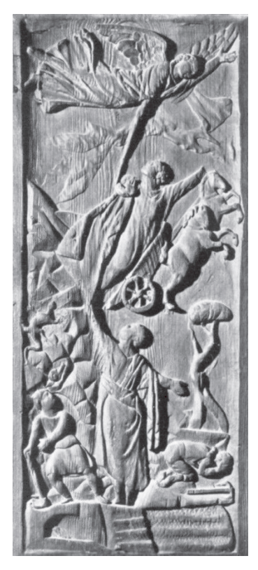
Fig. 2: Rome, S. Sabina, relief on wooden door, right side, about 430 AD: Ascension of Elijah: Elisha grasps the coat of the prophet.

Roman Genii. Based on the idea that celestial beings need to have wings, representations from the early 5<sup>th</sup> century onwards tend to depict winged, male angels. Until the Middle Ages this way of depicting angels remains the standard artistic convention (fig. 2).