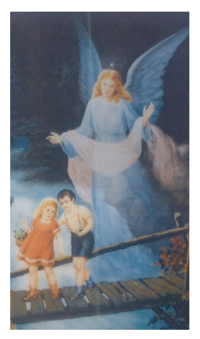
Fig. 3: Kitsch: A postcard with a guardian angel watching over two small children crossing a wild river, EGIM srl Milano, Italy.

martial and potentially bisexual males they had been.»<sup>17</sup> Therefore these female angels are often used to illustrate moments of the strongest emotions, greatest joy and most intense pain. We see these angels in various portraits of the deposition from the cross or supporting the dead Christ (so called angel pietà ).<sup>18</sup> But they also praise, often gathered in groups, the expectant mother or sing for the new born child. As so called (soul bearers) angels appear on Italian tombstones and mourning monuments in the 13<sup>th</sup> century.<sup>19</sup> As – in this sense – guardian angels, they watch over humans (Mt. 18:10) and assist them actively to avoid trespassing the law and live a good life. In the 14<sup>th</sup> century they also become guides or escorts of deceased persons – a development of the soul bearer role that transforms the function