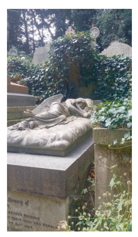
Fig. 6: The recumbent angel on the bed. Highgate East Cemetery.