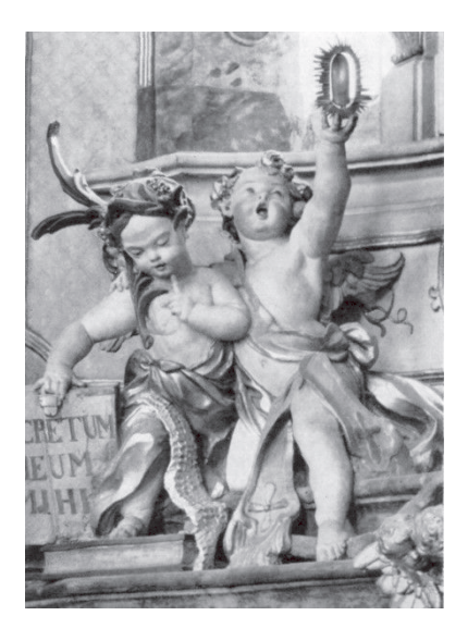
Fig. 4: Klosterkirche Osterhofen: Putto (Cherub) with attributes of the Saint John of Nepomuk (RDK V, 473, Abb. 86. E. Q. Asam, 1732, Photo: O. Poss, Regensburg, AS 4824).

of the guardian angel for the living into a continuing service that guides the deceased into the transcendent sphere of a specific afterlife.<sup>20</sup>