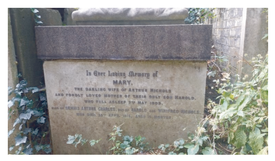
Fig. 7: The epitaph on Mary Nichols' grave. Highgate East Cemetery.

to a prospective state, which is of a higher potency than before.<sup>29</sup> The beholder thus has paradoxically enriched or increased his or her own reality by reflecting upon it by considering a monument of a past time. With Kierkegaard one might say that due to the actual reflection of experiences the whole remembrance process moves the beholder into a quasi-transcendent sphere because it enables him or her to catch a glimpse of what eternity might mean.<sup>30</sup>