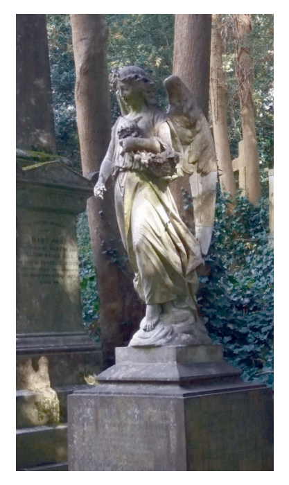
Fig. 11: This angel is scattering a forget-me-not, an explicit cue to the visitor. Highgate East Cemetery.

6. Tell Me What Angel Decorates Your Grave and I Tell You, Who You Were. A Short Summary