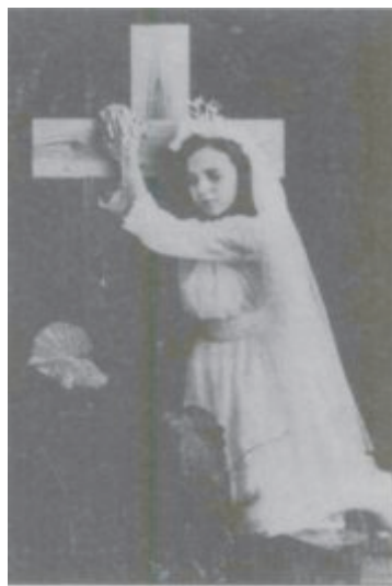
Fig. 5: First Communion Photograph (1911), (Hobbs 2006, 55).

The upper level of the Reissmann monument's «script» offers a visual exegesis of Toplady's hymn, «Rock of Ages». A veiled, female figure, embraces a stylized wooden cross, founded on rock (fig. 4), encapsulating a line from verse 3, «Simply to thy Cross I cling». The figure gazes upwards at the cross, garlanded with roses. 43 Strikingly, such a posture, of a woman ten-