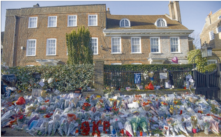
Fig. 1: A place for mourning in front of George Michael's house in Camden, London. 5

The example of George Michael's grave shows how the Trust regulates the cemetery's practices and usages. Obviously there is a private part in West Highgate that is not open to the public. The relatives' wishes may have formed part of the decision to make the grave non-accessible for visitors. But in addition the Friends of Highgate probably feared West Highgate Cemetery might become swamped by mourning fans, by their tributes and ultimately turning it into a place of mass pilgrimage as is the case with other tombs in East Highgate notably the grave of Karl Marx. 4 The Trust argues that there is not enough space to receive the tributes, which, on the one hand, is a little surprising given the spatial dimensions of the cemetery. On the other hand, however, the policy might be deemed reasonable remembering the pictures in the press of the huge piles of flowers, letters, candles and pictures among other things in front of George Michael's house in Camden (fig. 1).