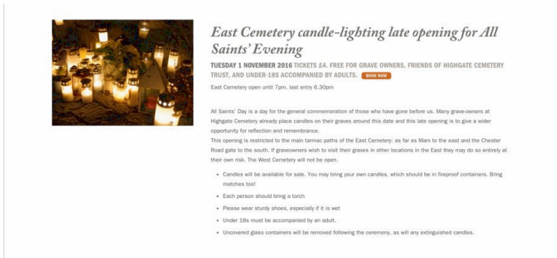
Fig. 7: Lighted candles are put on a grave to remember the deceased (Image: Screenshot, https://highgatecemetery.org ).

Another event refers to an explicit Christian practice and takes place at East Highgate. All Saints' Evening is celebrated on November 1 (fig. 7). Grave owners, the Friends of Highgate Cemetery trust and children under 18 years have free access. Everybody else needs to pay £4.