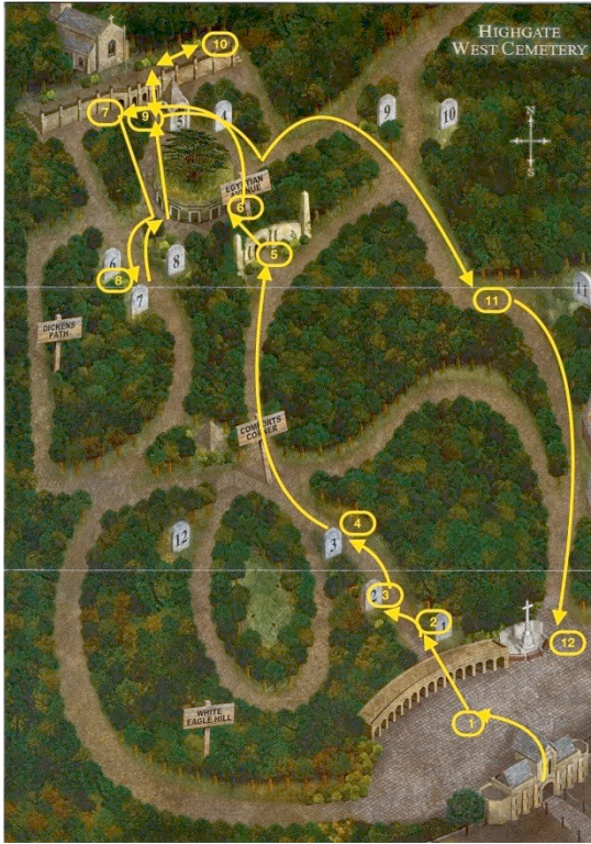
Fig. 8: The map is pictured on the back of the flyer that is distributed at the entrance to the cemetery.

The applied method of gathering data in the field and later interpreting it evaluates how the tour shapes the reception of the cemetery. The data is analysed by a combination of two approaches namely sociological hermeneutics of knowledge and grounded theory. 26 The analysing process has been adapted to the collected data of the field notes and is divided into three steps. 27 In the first step the audio recording has been transcribed. Next the transcribed text has been extended with the photographs namely the photos have been assigned to the text so that text and images are synchronized in space and time. Finally, the text has been divided into different kind of actions accomplished by the TG and the Ps. This included ver-