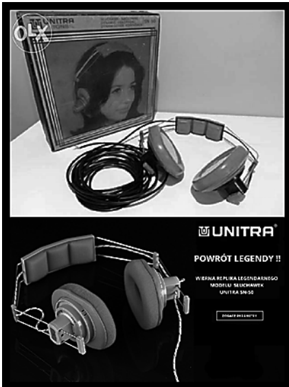
pic. 2: Original Unitra Sn-50 headphones and their 2014 counterpart advertised by the producer as a “faithful replica”.

(source: http://www.sklepunitra.pl/ ; http://olx.pl/oferta/sluchawki-unitra-sn50-orginaln-e-opakowanie-z-gwarancja-z-1975r-CID99-IDaMohh.html#a7499357c9 )