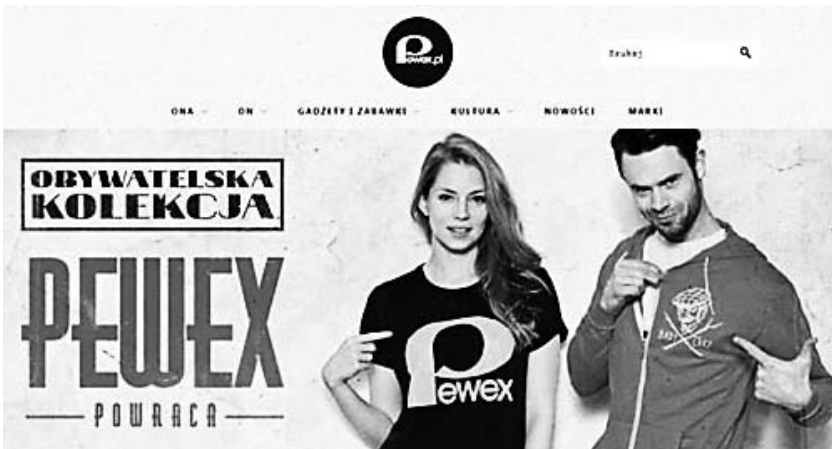
pic. 4: The main page of the Pewex.pl store with an advertisement of the ‘citizen’s collection’ which includes clothing with the Pewex logo