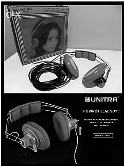
pic. 2: Original Unitra Sn-50 headphones and their 2014 counterpart advertised by the producer as a “faithful replica”.