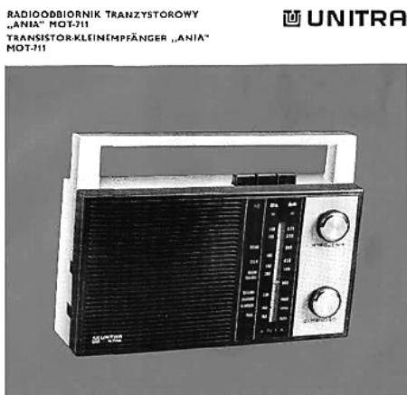
pic. 1: An original advertisement of an Unitra radio set.