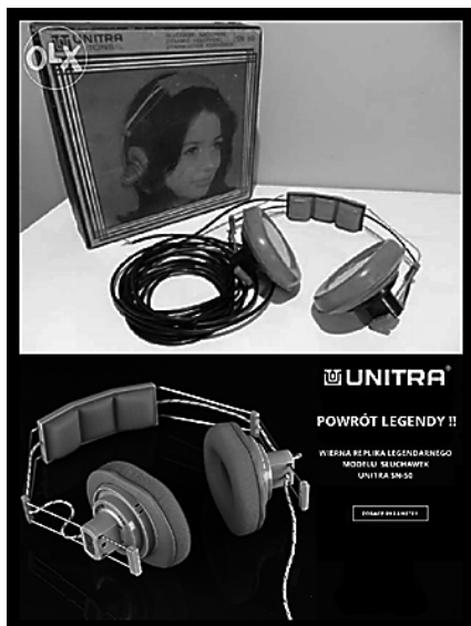
pic. 2: Original Unitra Sn-50 headphones and their 2014 counterpart advertised by the producer as a “faithful replica”.

(source: http://www.sklepunitra.pl/ ; http://olx.pl/oferta/sluchawki-unitra-sn50-orginaln-e-opakowanie-z-gwarancja-z-1975r-CID99-IDaMohh.html#a7499357c9 )