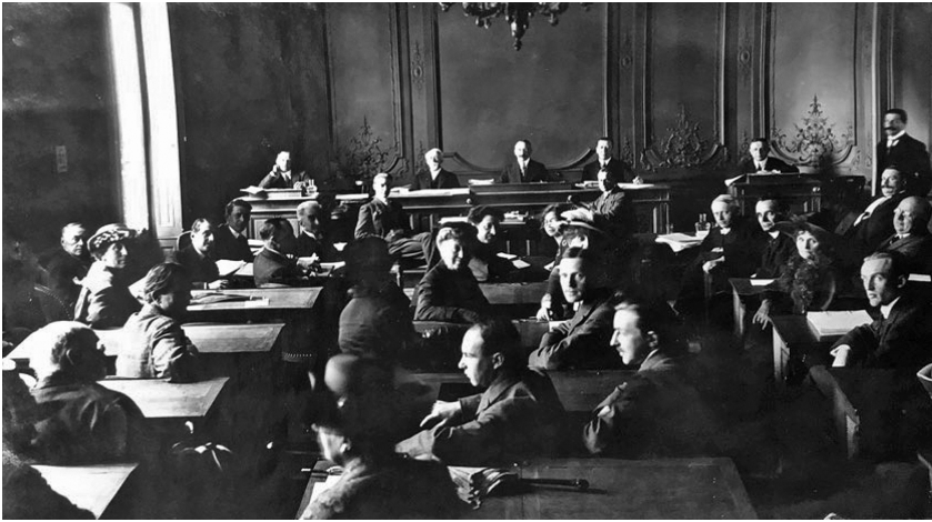
Audience du Tribunal mixte arbitral germano-belge, affaire Cie des wagons-lits, Genève, vers 1924.