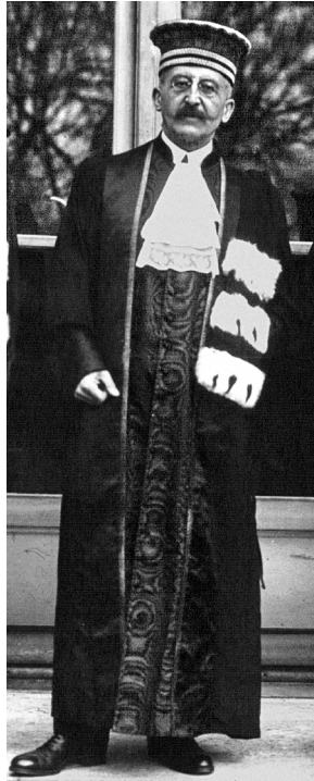
Paul Moriaud, président du Tribunal arbitral mixte germano-belge, le 7 janvier 1924. Détail d'une photographie de l'agence de presse Meurisse. Source: gallica.bnf.fr / Bibliothèque nationale de France.