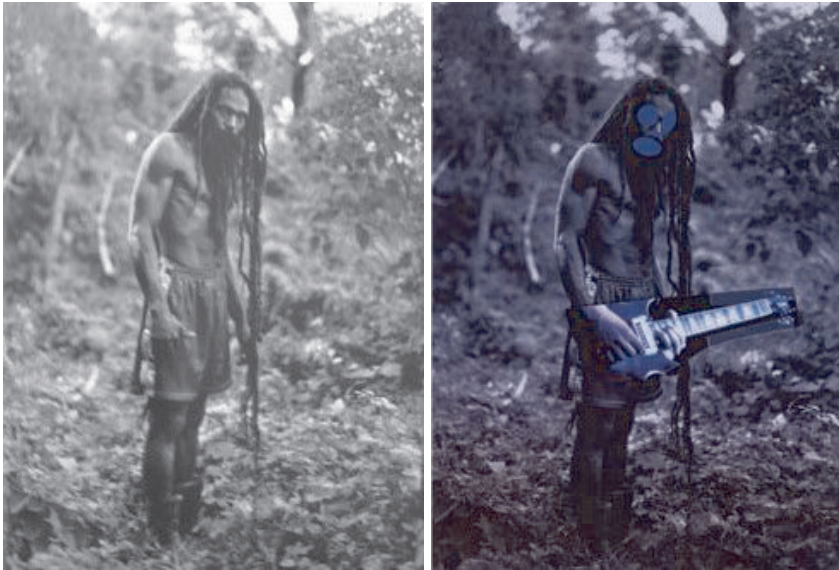
Figs. 5 and 6: Left: Patrick Cariou, photograph from “Yes, rasta” (2000); Right: Prince, work from “Canal Zone” (2008)

renowned 20 th -century artist, but also prevents the artist from publicly conveying his artistic message.