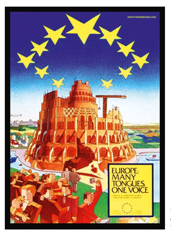
Fig. 6: EU Parliament, Construction Site Poster , 1992, unverified source.

support for his position, as well as visual and material examples produced by the EU. The fact that the Strasbourg EU Parliament building seems in some way based on Bruegel's Vienna Tower of Babel , is used as evidence of the EU's satanic impulses and rebellion against the divine will.<sup>56</sup> As is a curious poster apparently produced by the Council of Europe in 1992 (fig. 6).