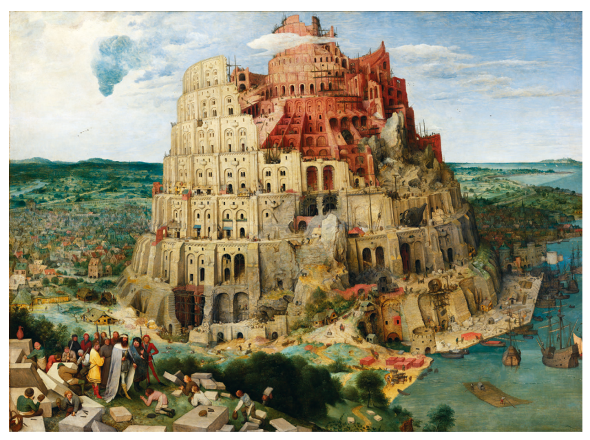
Fig. 1: Pieter Bruegel the Elder, The (Great) Tower of Babel , oil on wood, 114 × 155 cm, c. 1563, Kunsthistorisches Museum Vienna.<sup>17</sup>

rapid and unprecedented economic and demographic growth.<sup>18</sup> This in turn had led to geographic expansion and architectural transformation. As a result of this economic, demographic and architectural expansion, Antwerp was one of modern Europe's first metropolises, full of diversity of nationalities and languages and ambition. There are nods to Antwerp in Bruegel's Vienna Tower of Babel , in the busy harbour, some of the tower's architecture and the surrounding countryside. The geographical context to Bruegel's Vienna Tower of Babel cannot therefore be underestimated. Bruegel has re-cast the biblical Tower of Babel as contemporary Antwerp. Whether that implies a negative or a positive appraisal of developments in Antwerp depends on the commentator. The political context is also key. Since 1555, Flanders had been under the harsh Catholic rule of Philip II of Spain. Philip sought to suppress Protestantism in the region and in 1556 had enhanced the powers