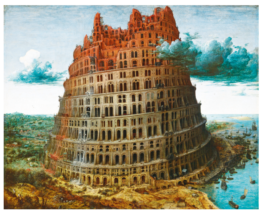
Fig. 2: Pieter Bruegel the Elder, The (Little) Tower of Babel , oil on panel, 60 × 74 cm, c. 1563–1568, Rotterdam, Museum Boijimans van Beuningen.<sup>26</sup>

sity.<sup>27</sup> As already mentioned above, the Polyglot Bible of c. 1569–1572 was an ambitious humanist project also endorsed by Pope Gregory XIII (although later opposed by some Spanish Theologians and denounced to the Inquisition).<sup>28</sup> In the main, however, the Polyglot Bible represents a prominent exercise in diversity and unity (drawing upon the work of Catholic, Protestant and even Jewish theologians in its creation), which is seen by Mansbach as crucial context to the Rotterdam Tower of Babel . Mansbach therefore encourages us to see the two paintings as representing two sides of Babel, the first a critique of personal and universal hubris (as in the Genesis narrative) and the second