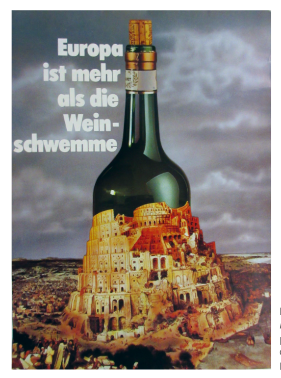
Fig. 4: Klaus Staeck, Europa ist mehr als die Weinschwemme, poster on paper, 1983.

EU (the wine glut etc.) that needs to be put to one side or whether it represents the positive side of the EU (unity in diversity etc.) is unclear. Either way, the notion of the positive aspects of the EU somehow representing the idea of reversing or remedying the Babel narrative is clearly conveyed here.