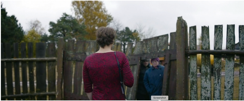
Fig. 3: Fences as markers of being an outsider. The Man Who Surprised Everyone (Natasha Merkulova/Aleksey Chupov, RU/EE/FR 2018), film still, 1:06:16. 88

sequences of events, or representing time as synchronicity – suggests that the narrative of one's life is not a causal sequence of events with a clear connection between a past that shapes one's present and leads into a well-defined future. Its focus on performance and theatre indicates that perhaps all identity is performative, and reality only another version of theatre.