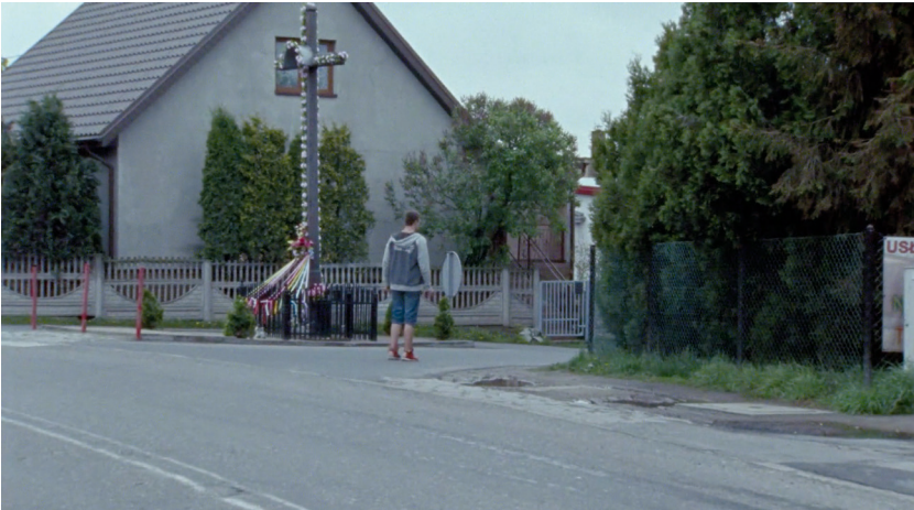
Fig. 5: Forgiveness? Eryk pauses at the maypole. Light as Feathers (Rosanne Pel, NL 2018), film still, 1:21:21. 94

cross-shaped maypole (fig. 5). This suggests a possible reading to me that is open to a transcendental dimension of forgiveness, even if its agents are clearly human, reflecting the Christian theological understanding of forgiveness at the intersection of the human and divine.