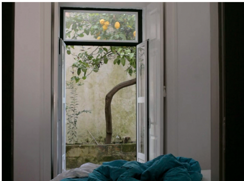
Fig. 4: Still life with lemon tree. Antonio One Two Three (Leonardo Mouramateus, PT/BR 2017), film still, 1:34:15. 91

focus on topics of concern to Europe, in particular questions of family and relationships, crises and conflicts, and identity and meaning. In their treatment of these issues, the films emphasise the perspective of those at the margins, either geographically, in films set at the margins of Europe, or socially, by focusing on protagonists experiencing social exclusion, economic hardships, or prejudice. With their formal emphasis on realism and open-ended narratives, the films encourage viewers to take responsibility with regard to the issues raised in a film and thus contribute to the promotion of values such as dignity, social justice, solidarity, diversity and the common good, which may be considered as shared »European« values.