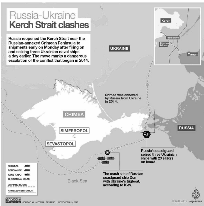
Map of the Kerch Strait incident

On the morning of 25 November 2018, three Ukrainian vessels – two artillery boats and a tugboat – sailed towards the Kerch Strait aiming to transit to the Ukrainian port Mariupol. They were intercepted by the Russian Coast guard. The Russians rammed the Ukrainian tugboat and tried to turn it away, but the Ukrainians did not give up. 1297 The standoff dragged on throughout the day until the Russian Coast Guard, assisted by special forces, pursued the Ukrainian Ships, fired upon them, boarded them, and took 23 seamen prisoner. In the course of the attack, at least three Ukrainian seamen were injured. The above facts are undisputed, Russia quickly confirmed the use of armed force. 1298