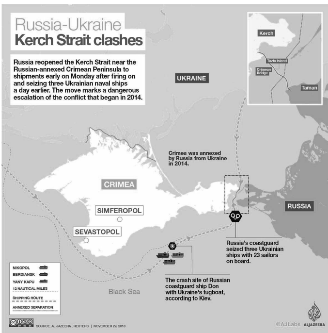
Map of the Kerch Strait incident

On the morning of 25 November 2018, three Ukrainian vessels – two artillery boats and a tugboat – sailed towards the Kerch Strait aiming to transit to the Ukrainian port Mariupol. They were intercepted by the Russian Coast guard. The Russians rammed the Ukrainian tugboat and tried to turn it away, but the Ukrainians did not give up. 1297 The standoff dragged on throughout the day until the Russian Coast Guard, assisted by special forces, pursued the Ukrainian Ships, fired upon them, boarded them, and took 23 seamen prisoner. In the course of the attack, at least three Ukrainian seamen were injured. The above facts are undisputed, Russia quickly confirmed the use of armed force. 1298