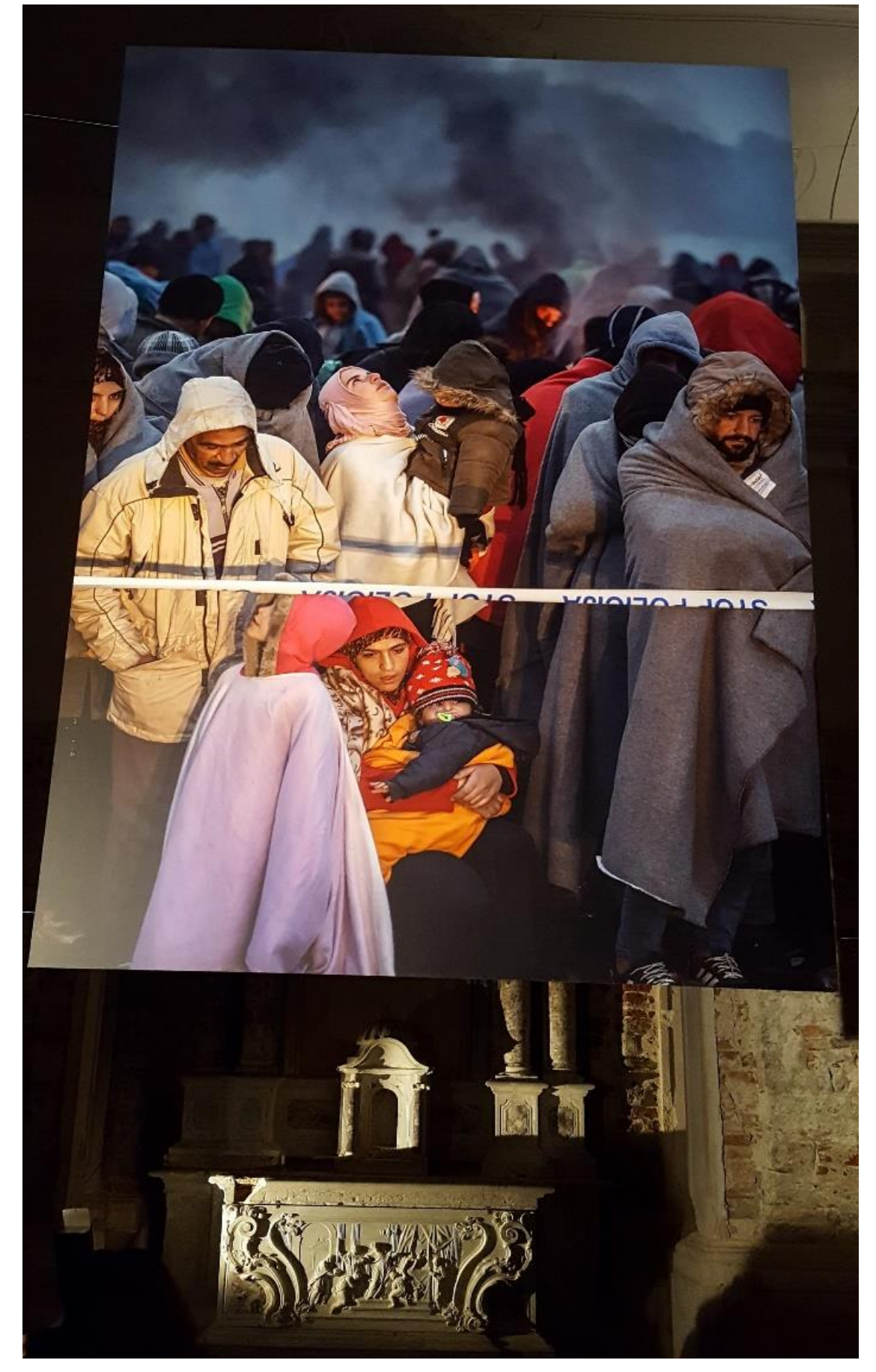
Figure 2: Borut Krajnc, The Path, 2016