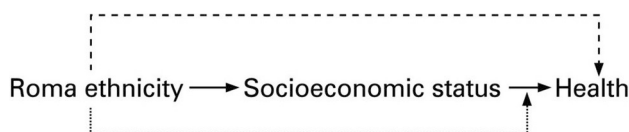
Figure 1 – The theoretical model investigated in the study