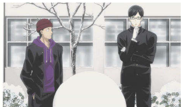
Figure 1. Screenshots of Mushi-shi (2005) and Haven’t you heard? I’m Sakamoto (2016), from left to right.