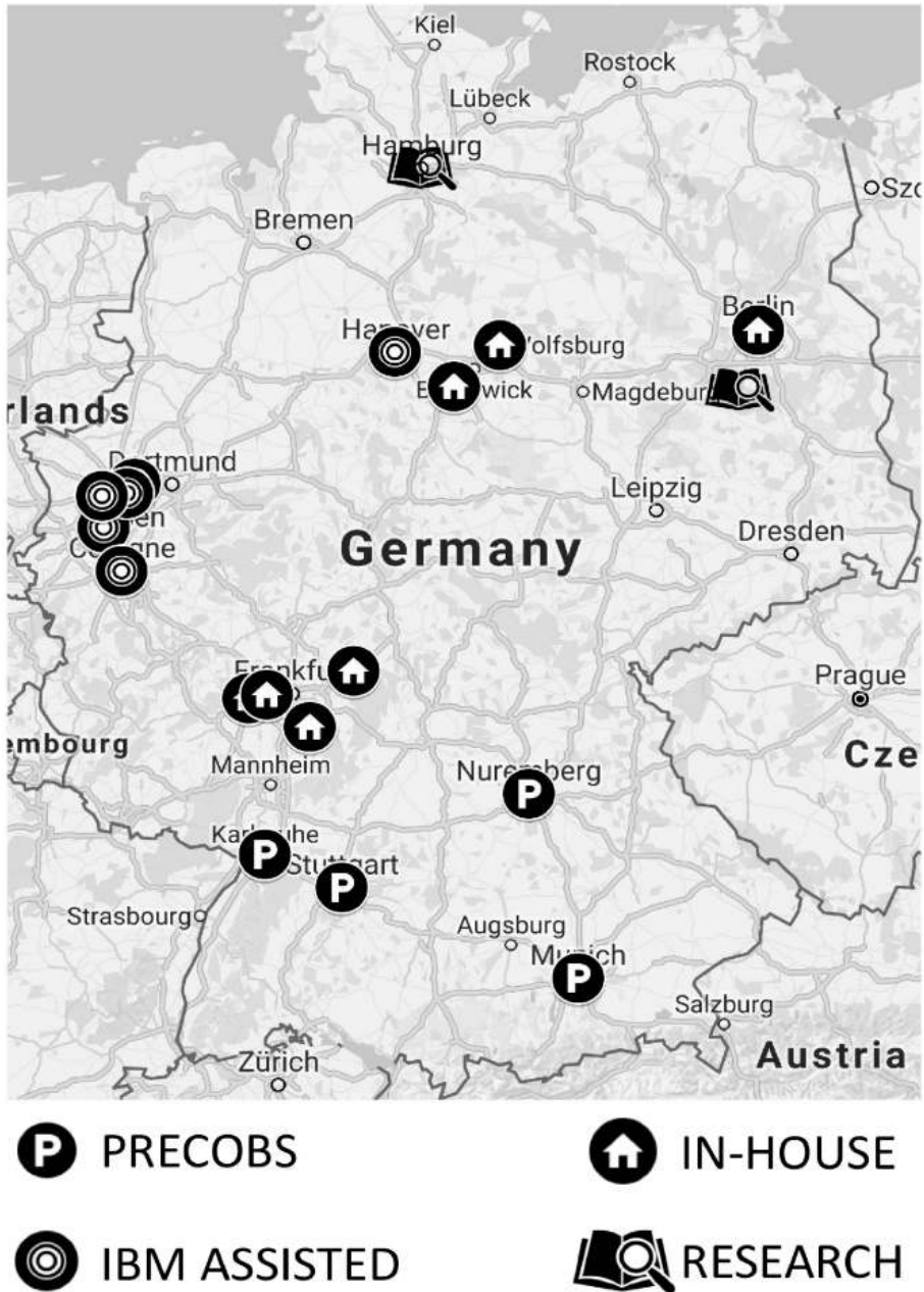
FIGURE 2: DISTRIBUTION MAP OF GEOSPATIAL PREDICTIVE POLICING IN GERMANY