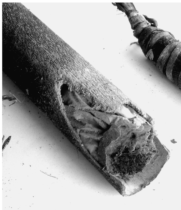
Fig. 3: Ahah – the powder obtained from the burned leg bones of a powerful man.

3. Another important ingredient – ahih – is lime made from burning the leg bones of a powerful man such as a warrior. The ahih is made by specialists, mostly from Nimbiu Kragamun villages. It takes on a red colour from being mixed with sap from a bush vine ( ubianih ). Other bush herbs, such as red nettle leaves ( nihigeh ) and vines, are also added. The latter, along with lemon, help make the lime "hot." When it has dried, a red residue is left, and this is mixed together with the ashes as lime. The ahih , kept in bamboo tubes (see Fig. 3), is regarded as powerful and dangerous. These days red paint can be bought from the shops to substitute for colouring from the vines.