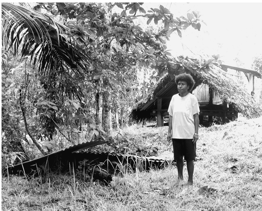
Fig. 1: The present-day view of the site of M. Mead's dwelling during her research in Alitua.

Mead was based in a day's walk from our principal field site. 4 There are minor cultural differences between the Plains and Mountain Arapesh, for example, variation in interior house design, recognisable differences in songs and dances, differences in the way bride-price is given and compensation paid. Mountain Arapesh still engage in more hunting than Plains Arapesh. Pronunciation differs, for example, the word Arapesh (meaning "men" [pl.]) sounds more like "Elpech" when spoken by people from the Plains.