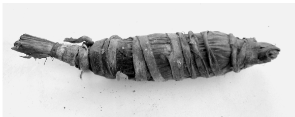
Fig. 2: Posin – the magical bundle used for sorcery.

The term “poison” also can have several meanings. One, closer to the Standard English use of the term refers to a toxic substance which, if ingested, will cause sickness or death. At other times the term posin is used as a Melanesian pidgin expression for sorcery. In pidgin usage in the Sepik today, the term posin most often refers to the “leavings” or “specimen” (what Margaret Mead terms “exuviae”) of a person, bound up in a packet of leaves, which will be used in the practice of sorcery (see Fig. 2).