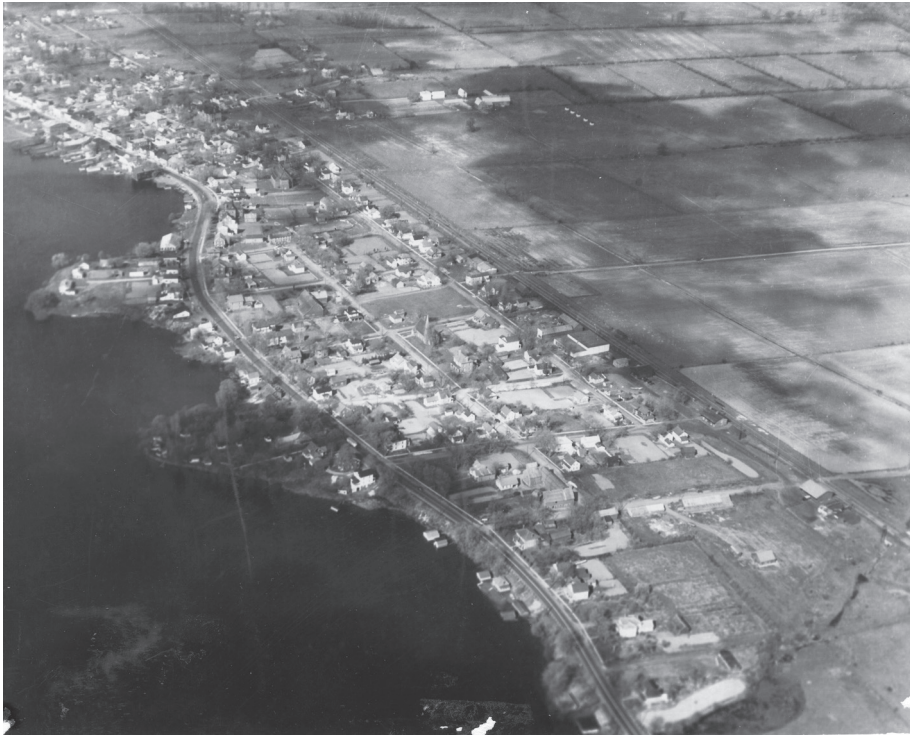
Fig. 3: The village of Iroquois before the Seaway was built.

In Iroquois too, managing without the river was going to be tough for everyone. Their bodies were familiar of the river, their senses of self dependent upon time-worn knowledge of the St. Lawrence and its ways. The river was “your scenery ... you’d go back to the back streets and the side streets, but you’d always be looking at the river over there, by these houses. The river was always there.” Even for adults, pressed by responsibilities as parents and wage-earners, church and community leaders, the river was a vicarious pleasure, an enveloping, prospective solace. “I loved that water, ... loved to see other people out enjoying themselves, ... when I did find time, I just loved the river ... just the fact that I could go out and wander around and stand around.” Aurally, the river was the keynote of the village. “Normally the river was fairly quiet, but you knew it was there.” It had an ambient quality of shifting precedence. “I know at night many times my father’s been fishing across the river and I’d go down to meet him, and ... I’d sit there – you could hear the river, it was quite rough and you could hear it very plain.” Sometimes the river was a signal. “You could hear it slapping up against the banks, rough days when it was windy.” But most days the river was the barely perceptible yet comforting ordinary of the village soundscape, a kind of muted roar. This keynote had a deep and pervasive influence on the behaviour and moods of