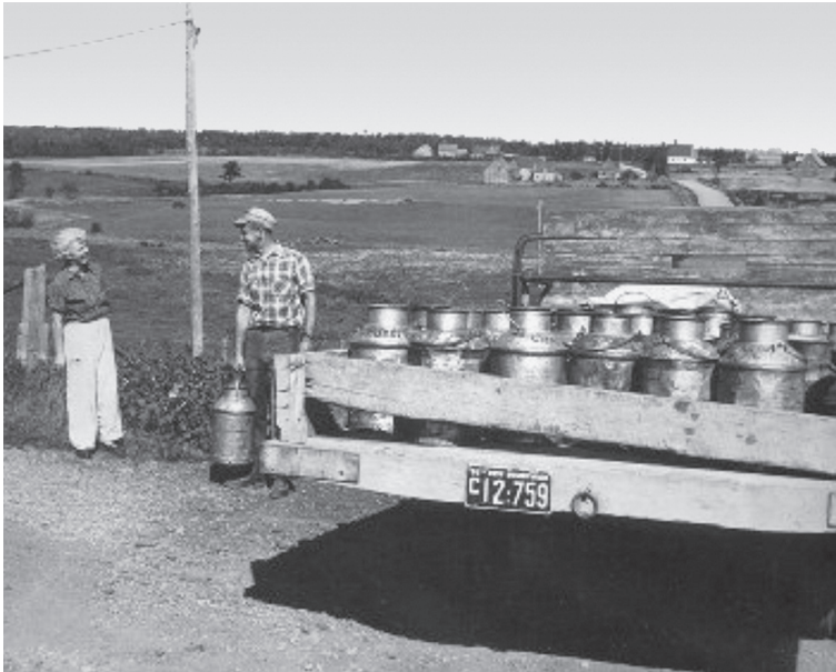
Fig. 2: The Gagetown Lands before the military base was built: a farm woman waiting for the cream truck, cleared fields before, village behind, good road network and rural electrical service.